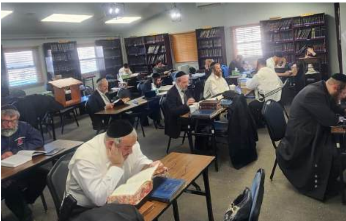
Learning in the Heichal HaTorah