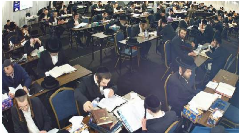
Early Friday Morning Shovavim Learning