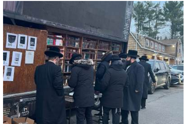
Selling Seforim for Yud Tes Kislev at the Shul