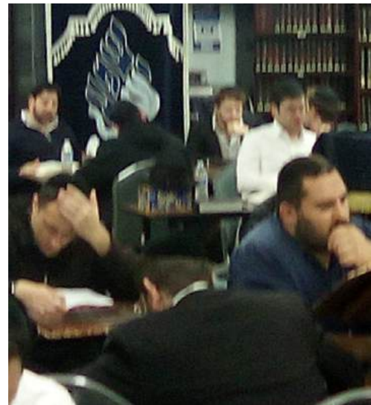
Learning at The Night Kollel